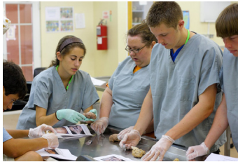
Students gaining hands-on experience at the 2008 Med/Vet Summer Academy.